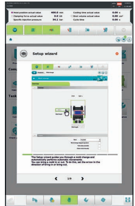
Fig. 3. The Setup Wizard is software that interactively guides the machine operator through the individual steps of a tool change. This tutorial is one of the first that Engel developed

The tutorial has a separate page for employees, who are responsible for opti-