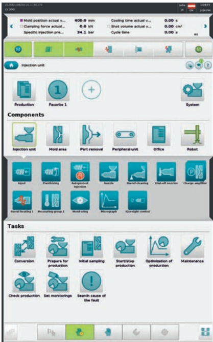
Fig. 1. Components and tasks are combined on a common page in the new interface. This improves clarity and saves time