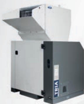
BM Series BM 6042 BM 9042 BM 12042