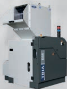
BM Series BM 3530 BM 5030