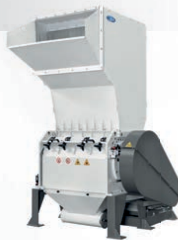
BM Series BM 7060 BM 11060